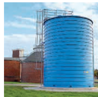
LIPP gas storage tank