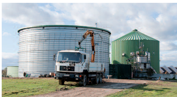
LIPP universal digester (left)