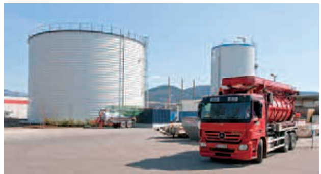
LIPP storage tank for fermentation residues with 4000 m 3 capacity

The lightweight construction is also suitable for sealing tanks containing volatile and explosive substances.