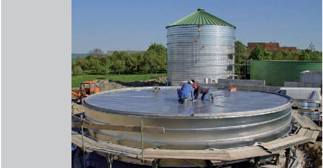
Assembly of stainless steel membrane cover