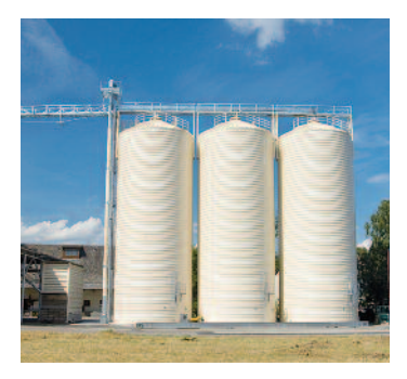
Fast On-Site Assembly