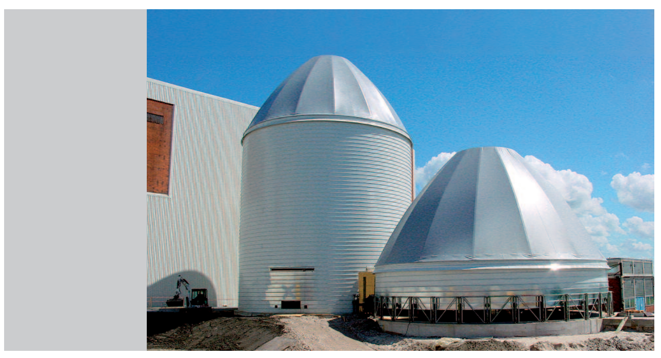
Electricity plant in Germany: LIPP Bulk Storage Silos for storage of woodchips