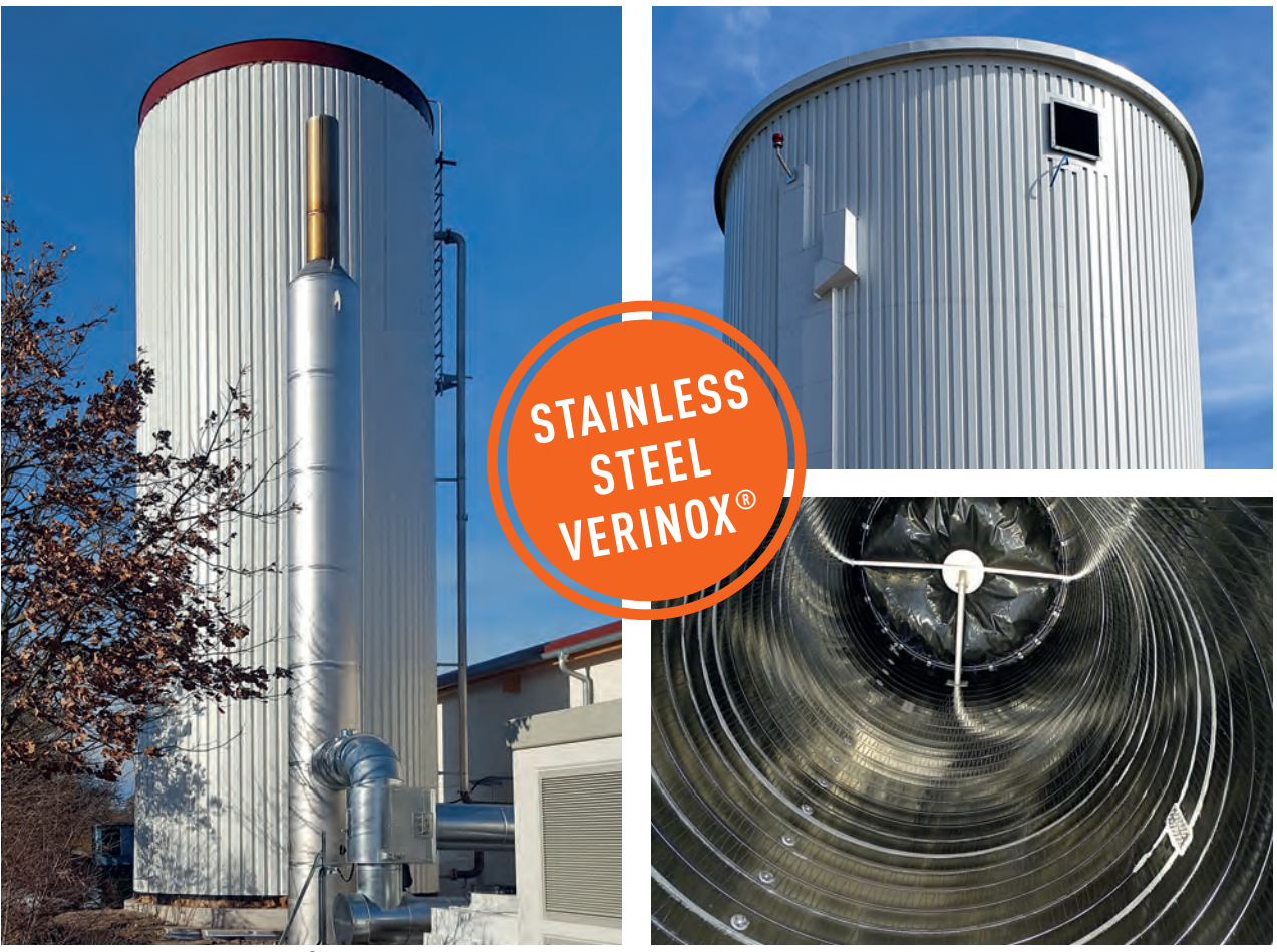
LIPP Thermal Storage Tank, 300 m³ volume