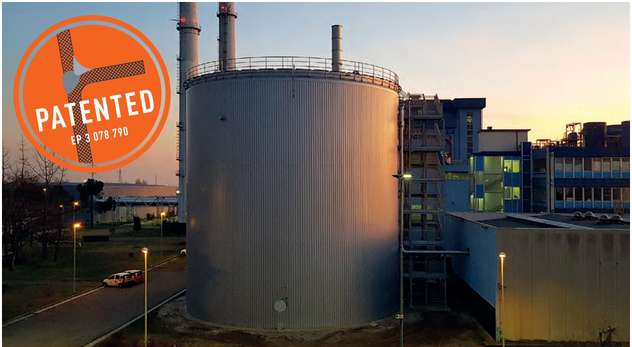
LIPP welded Thermal Storage Tank, 4,900 m 3