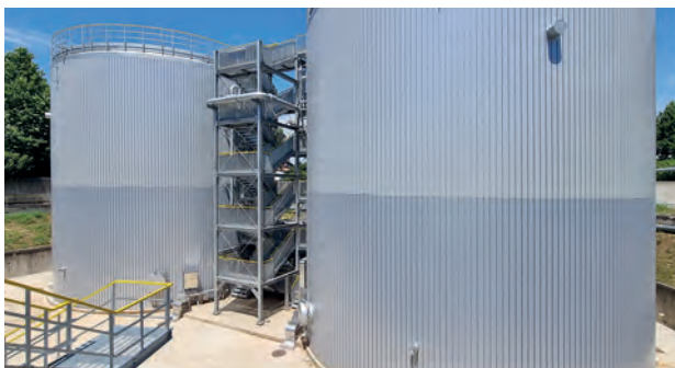
Two LIPP welded Thermal Storage Tanks each 2,100 m 3

LIPP storage tanks can be assembled quickly on-site outdoors or indoors. The special revolving profile provides additional stability compared to conventional procedures.