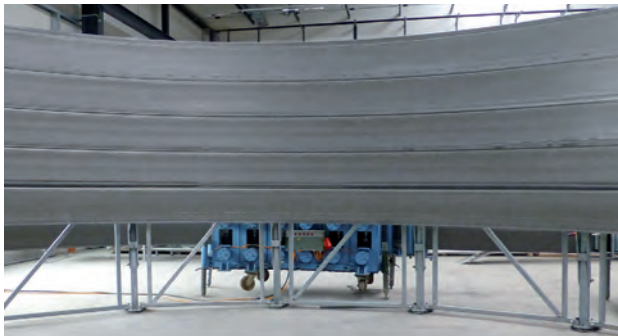
Interior view, LIPP steel tank during production