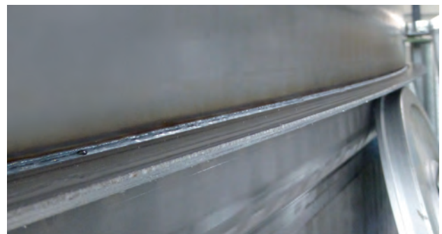
LIPP steel tank with special revolving profile

PRODUCTINFO //////////////////////////////////////