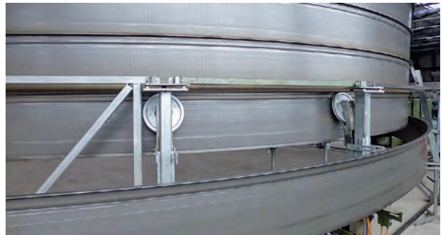
Exterior view, LIPP steel tank during production